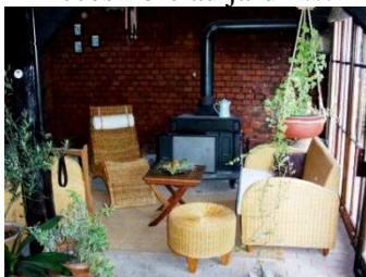
...Et au jardin d'hiver (non chauffé)