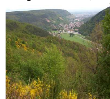
La vallée de Guebwiller