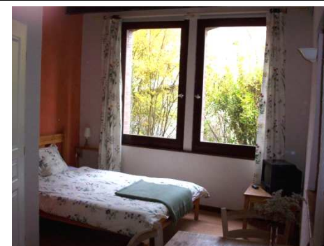
Chambre côté jardin, au bord de l'eau