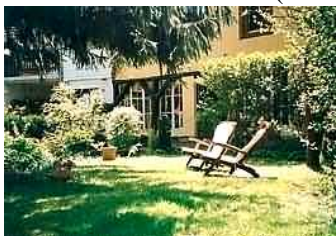
Accès libre au jardin...