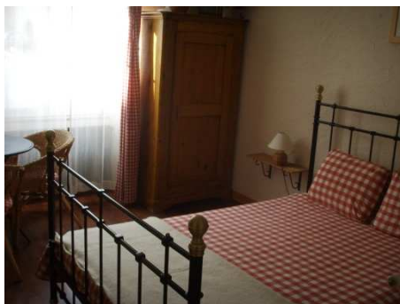
Chambre exposée sud, côté village