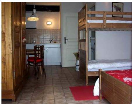
Aménagée comme un studio. Au sud, côté village